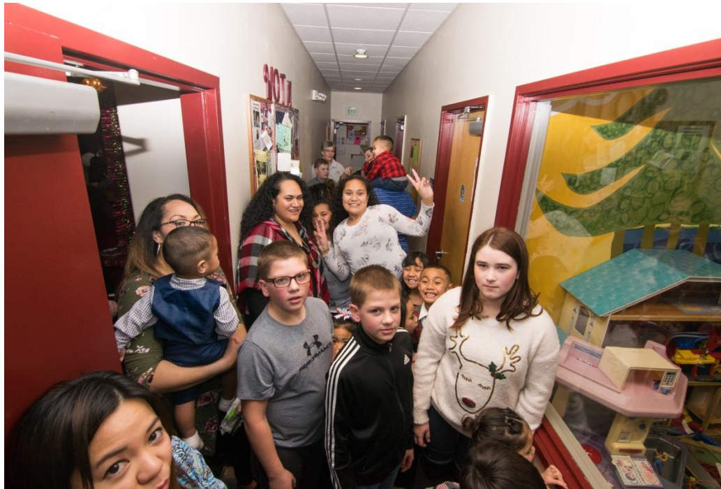
The Santa Line