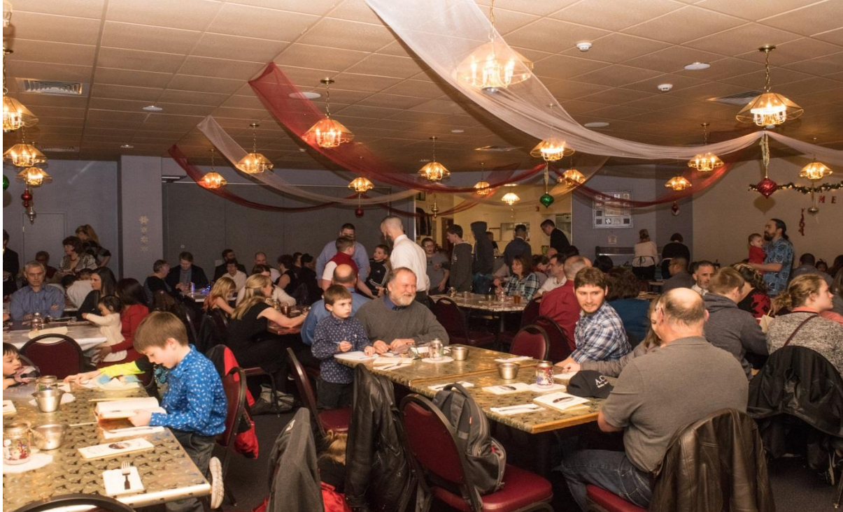
Juneau Moose Lodge Banquet Hall